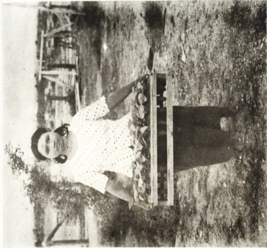
Fig 2. A worker carrying 50 padauk seedlings in portable and semi-durable plastic tubes.