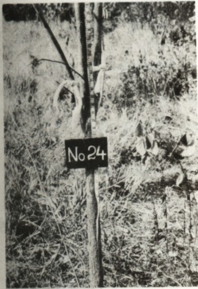
Fig 1. Small lateral branches are removed. The white ribbon indicates the position of cutting.