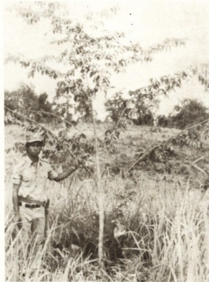
Fig 4. 7 months old coppice shoot with lateral branches in Moswe Reserve, Compartment 72, Yemathin Forest Division.

Branching characteristics of Padauk in artificial regeneration.