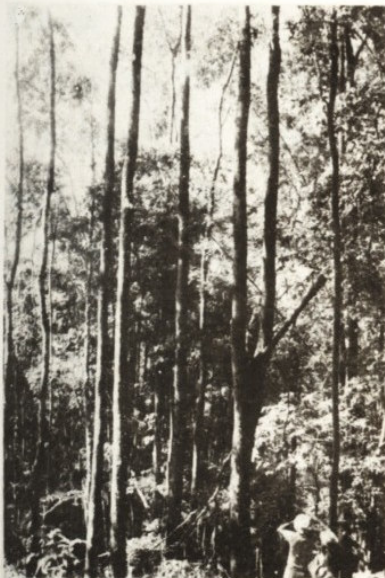
Fig 3. A patch of straight clean bole of Padauk plantation Gwethe Reserve, Compartment 38, North Taungoo Forest Division.