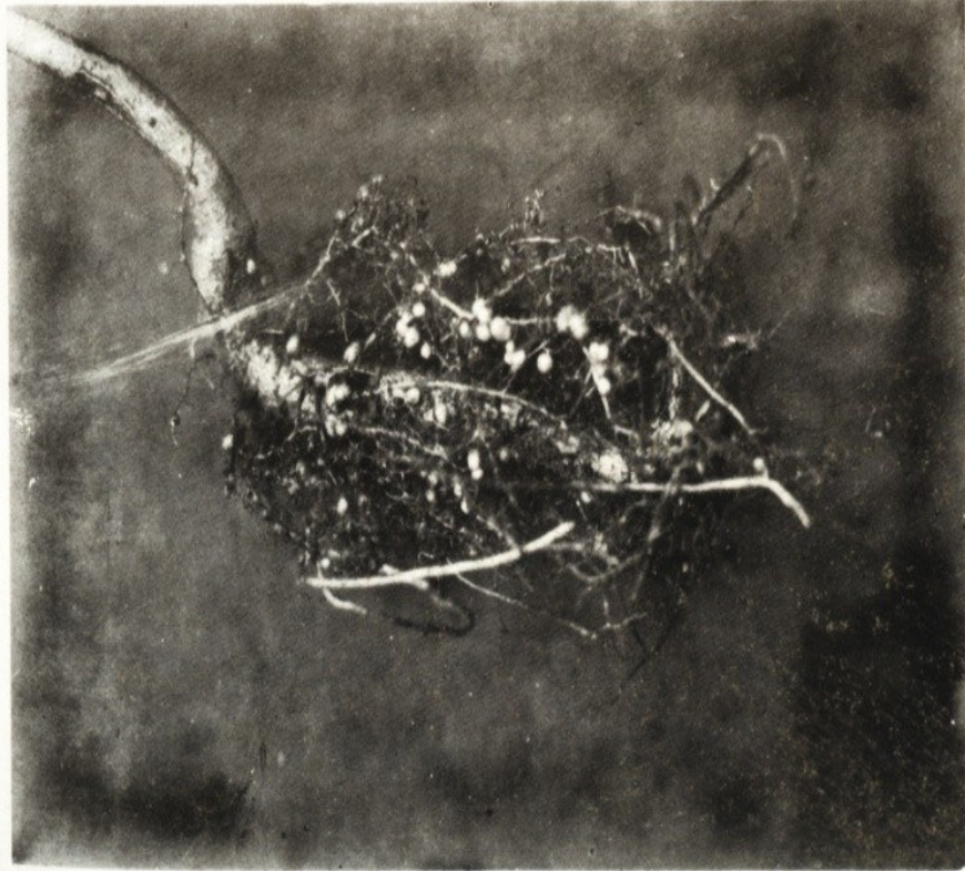
Fig 1. A well-developed root nodules on 3 month old padauk seedlings.