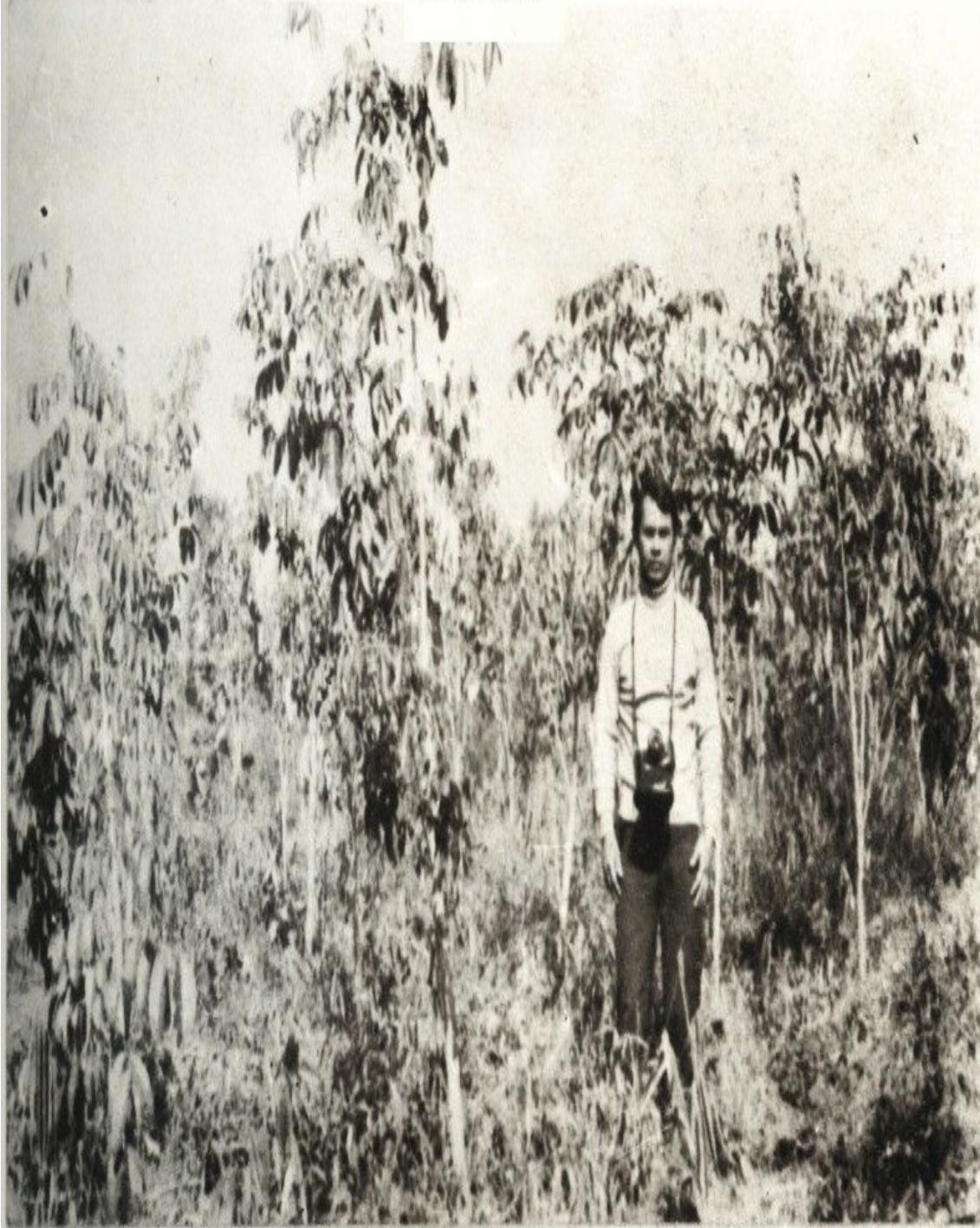
2 years old padauk plantation in Moswe Reserve, Compartment 72, Yemethin Forest Division. Average height, 7.82 feet.