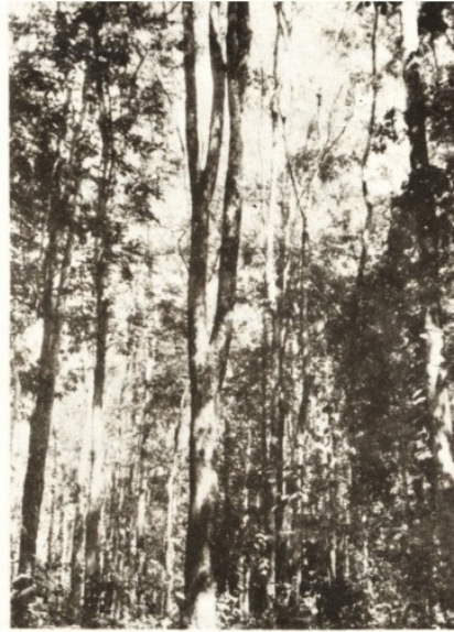
Fig 2. A double forks on the same Padauk tree in Padauk plantation, Gwethe Reserve Compartment 38, North Taungoo Forest Division.