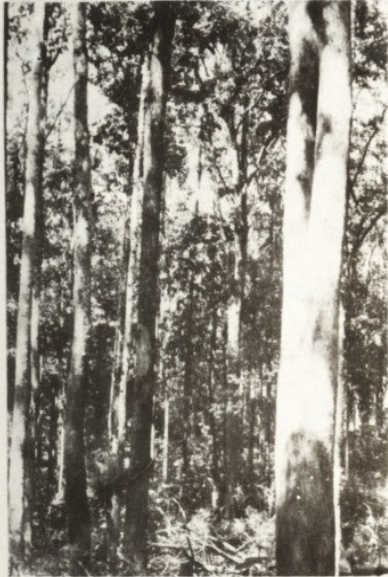
Fig 1. A forked Padauk tree with some straight clean bole of padauk plantation in Gwethe Reserve.