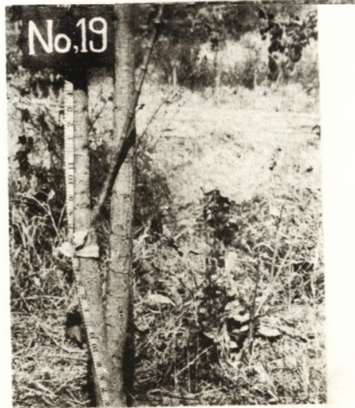
Fig 2. One of the two equally strong stems is removed. The white label indicates the removed stem.