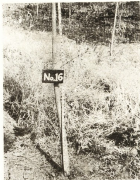
Fig 4. A straight stem is left uncut.

4 types of pruning to a 2-years old Padauk plantation.