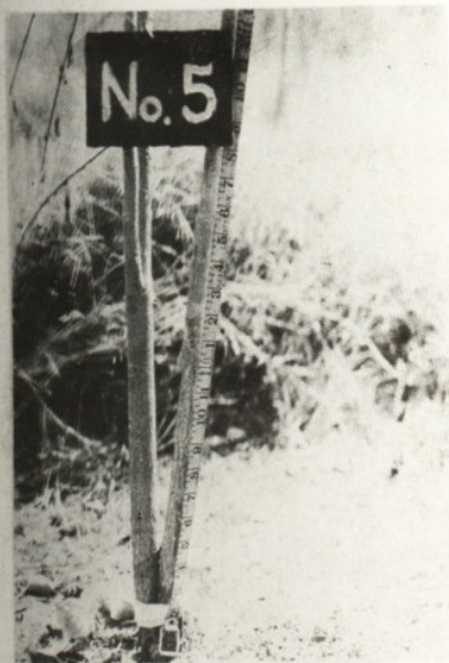
Fig 3. Low fork tree is cut flush to the ground. The ribbon indicates the position of cutting.